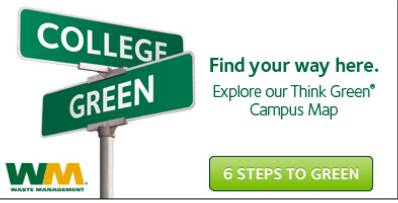
Chart your path to campus-wide sustainability using Waste Management's interactive Think Green® Campus Map. The updated map is a vital addition to our successful Think Green® Campus Model – a total framework for sustainability – and can help guide you to the ultimate destination of zero