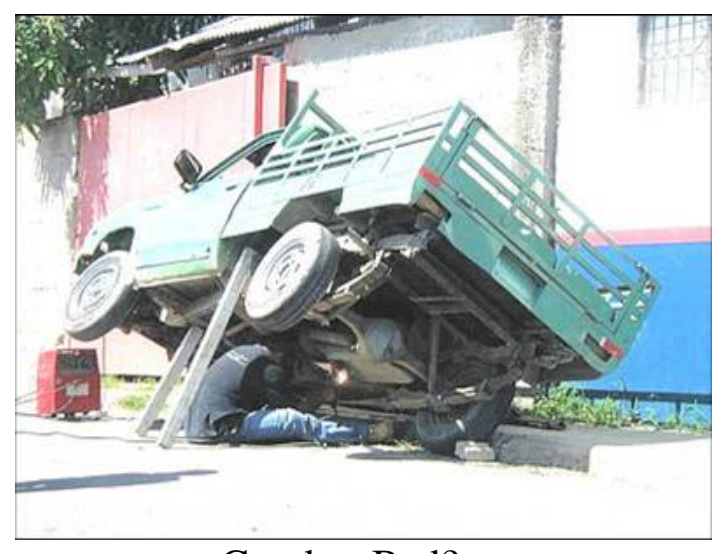
Good or Bad?

To end on a fun note, here's an example of one of the silly questions we had during the training session: