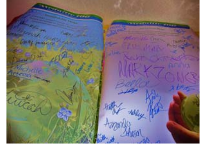
Signed Pledge Posters