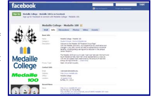
Medaille 100 Facebook Page