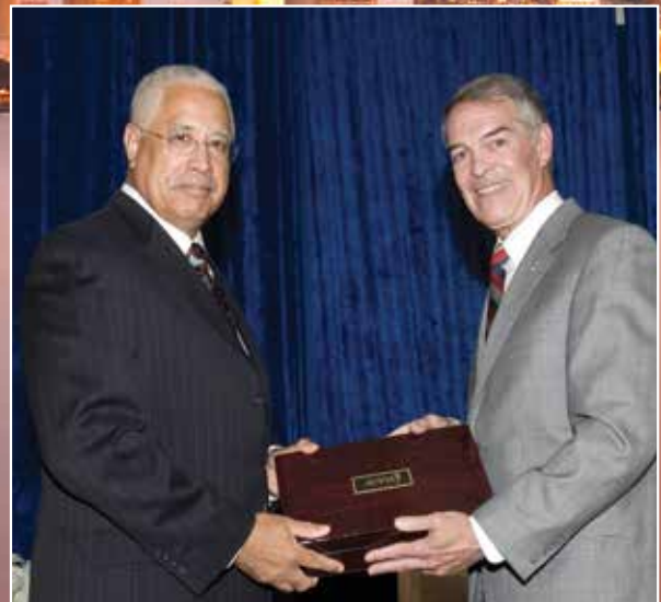
PRESIDENT'S RECOGNITION AND GAVEL EXCHANGE