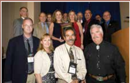
University of New Mexico