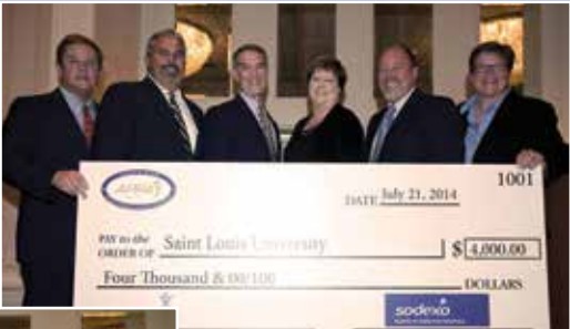
Saint Louis University