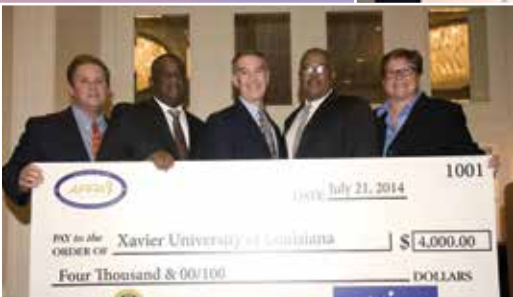
Xavier University of Louisiana