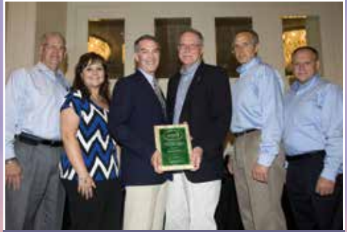
Penn State University