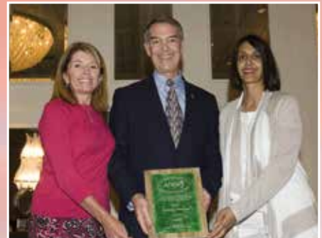
University of Rochester