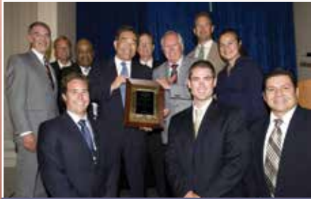
Soka University of America