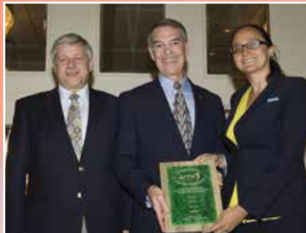
University of California Los Angeles