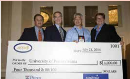
University of Pennsylvania