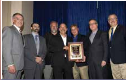
University of Michigan