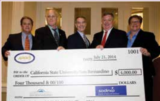
California State University - San Bernardino