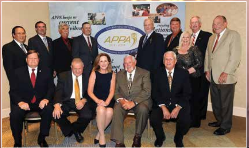
APPA PAST PRESIDENTS