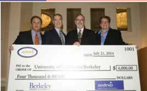
University of California Berkeley