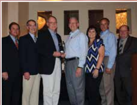
Institutional: Penn State University