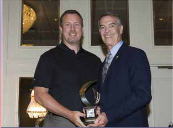
JLG Industries, Inc. Siemens Industry, Inc. - Building Technologies Division