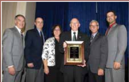
University of North Carolina Charlotte