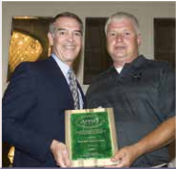
Black Hills State University