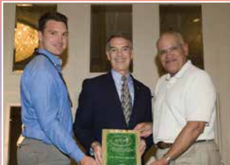
San Mateo County Community College District