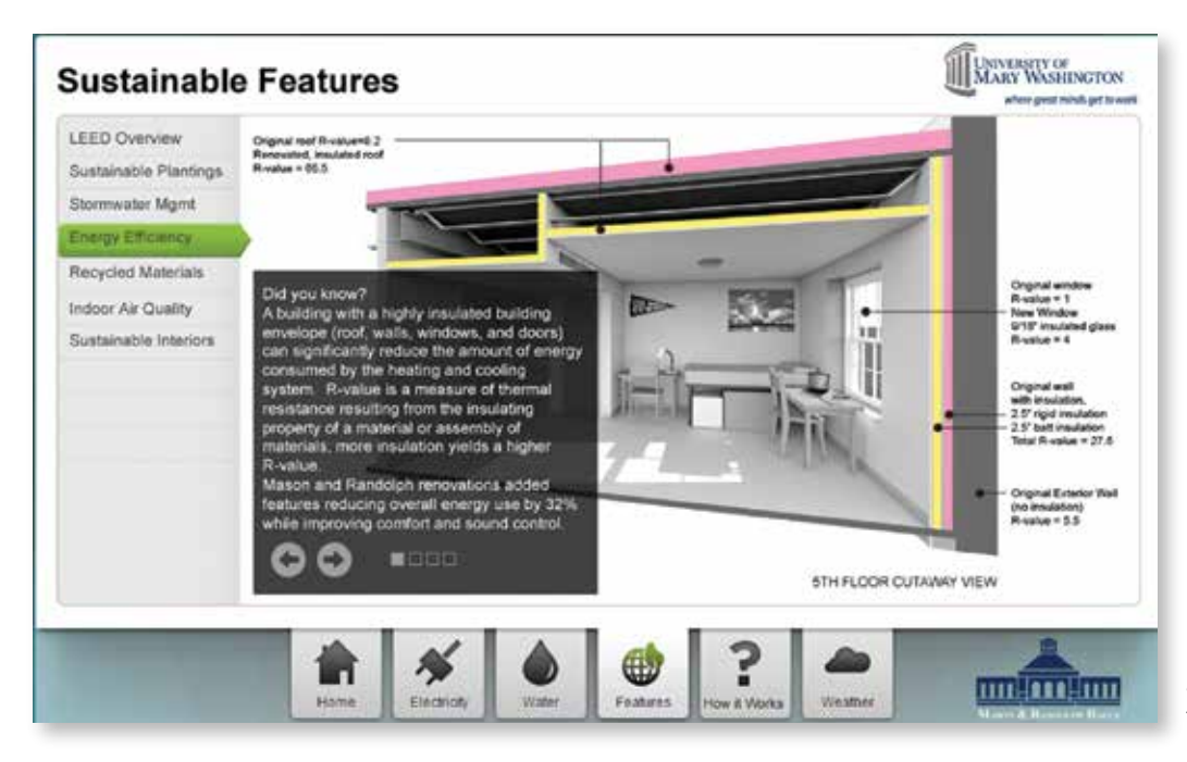
Energy dashboard interface provides a visible teaching moment at UMW for students and faculty alike.

access is a great strategy. The grade-revision concept lends itself especially well to faculty residence quarters as well as to indooroutdoor, common gathering spaces. Whatever the program, improving staff interaction and campus access for residents is a key strategy.