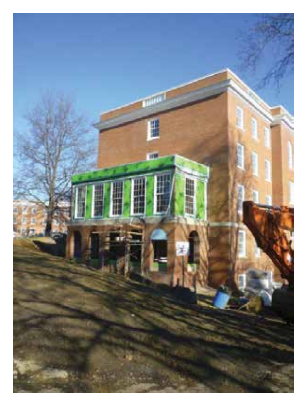
University of Mary Washington: new amenities located, contextually, in original porch locations.

Residence halls greater than 30 years old comprise, in high percentage, double occupancy rooms on double-loaded corridors (sometimes with individual lavatories, often with communal showers). Due to window rhythm and placement, there is little opportunity to rearrange these two-student rooms in a more efficient manner. Sometimes it is easy to create a more efficient plan by morphing standard two-student rooms into higher occupancy suites. This is especially true when common space and amenities such as communal bath and shower facilities, study areas, and kitchens can be moved to new, adjacent additions.