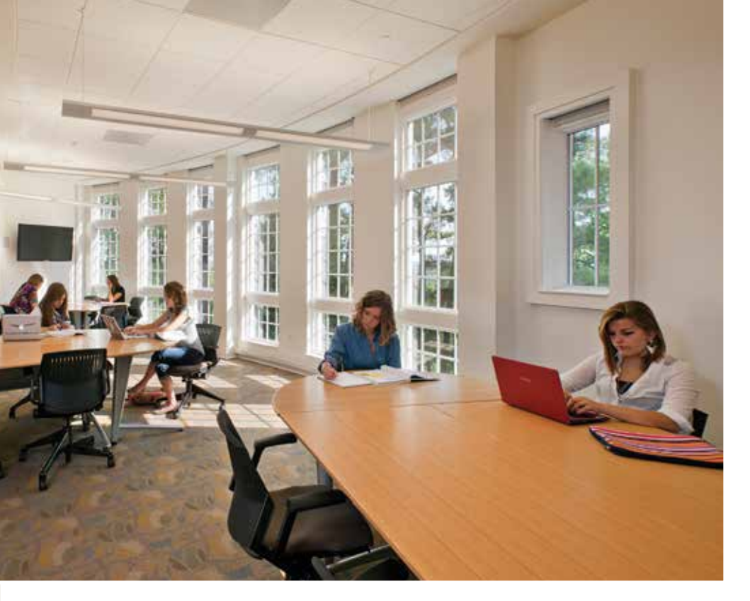
Flexible common area arranged for independent study.