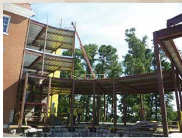
University of Mary Washington addition facilitating new vertical transport.

hazardous materials is an obvious mandate and can be a costly undertaking. With luck, the building has already undergone full or partial remediation at some point in its history. Before suffering "sticker-shock" at added remediation costs, consider that