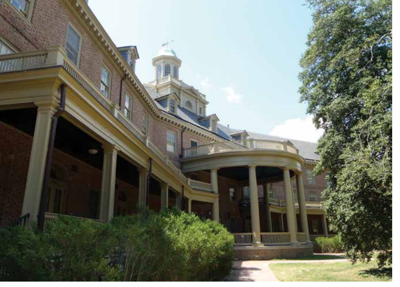
College of William & Mary Barrett Hall—HVAC infrastructure and window replacement to original 1937 construction.

the cost of abatement likely totals far less than the cost of total demolition of the building and clearing and preparation of the site for a new construction.