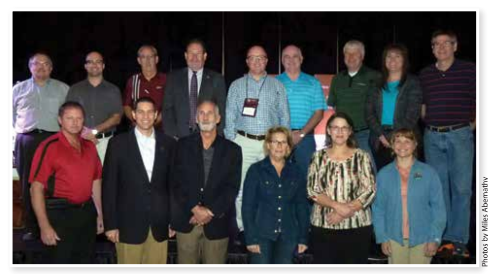
2015 CAPPA Executive Committee members.

Collaboration was clearly evident at the exhibit hall in the El Paso Convention Center, where business partners staffed 62 exhibits geared to the needs and interests of CAPPA members. Several business partners sponsored prizes, lunches in the exhibit hall, and other networking opportunities throughout the conference.