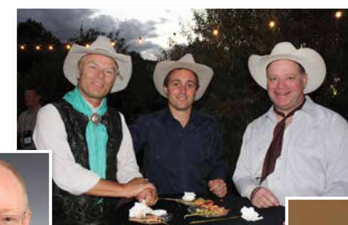
Three Amigos enjoy the theme dinner.

was held at the New Mexico Museum of International Folk Art & Museum of Indian Arts