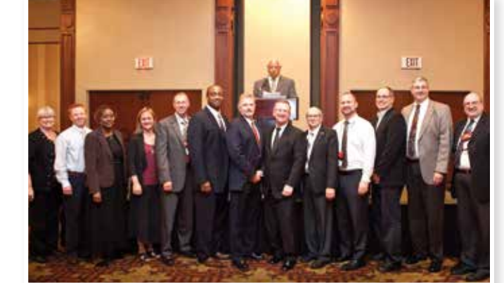
MAPPA board members for 2014-15.