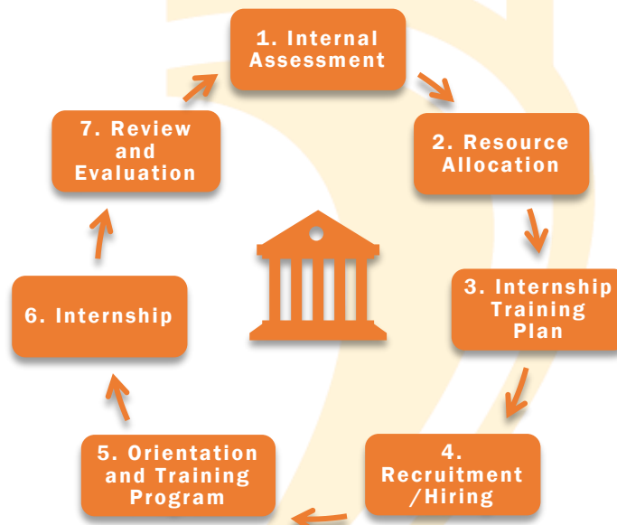
Figure 1: APPA Internship Process for Host Institution/Organization

The Host Institution/Organization Checklist can be used as a guide for completing the APPA Student Internship Program process. Please visit https://www.appa.org/JobExpress/internships.cfm to download supporting resources.