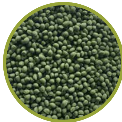
Thermoplastic elastomer (TPE)

For a typical 85,000-sq.-ft. field, the costs for quality TPE pellets can add approximately $200,000 to a project's initial costs for infill material, plus the cost for a shock pad ($85,000–$130,000). Availability of TPE can be an issue; historically it has been imported mainly from Europe, although it has recently become more available in the United States. Its maintenance requirements are similar to those for SBR.