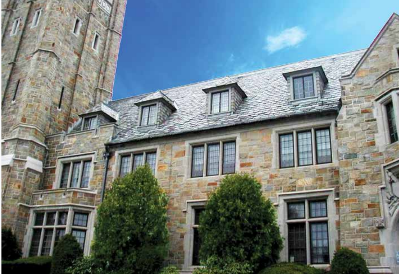
Steel window replacement and restoration.