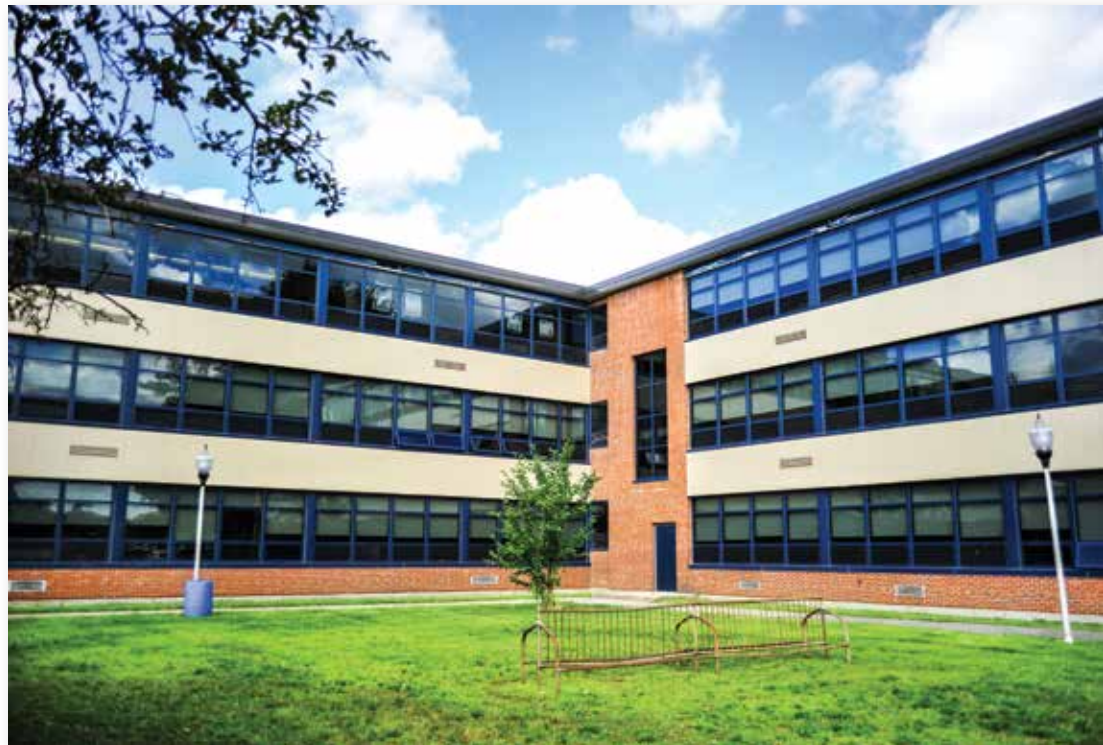
Aluminum window, curtain wall, and insulated metal wall panel replacement.