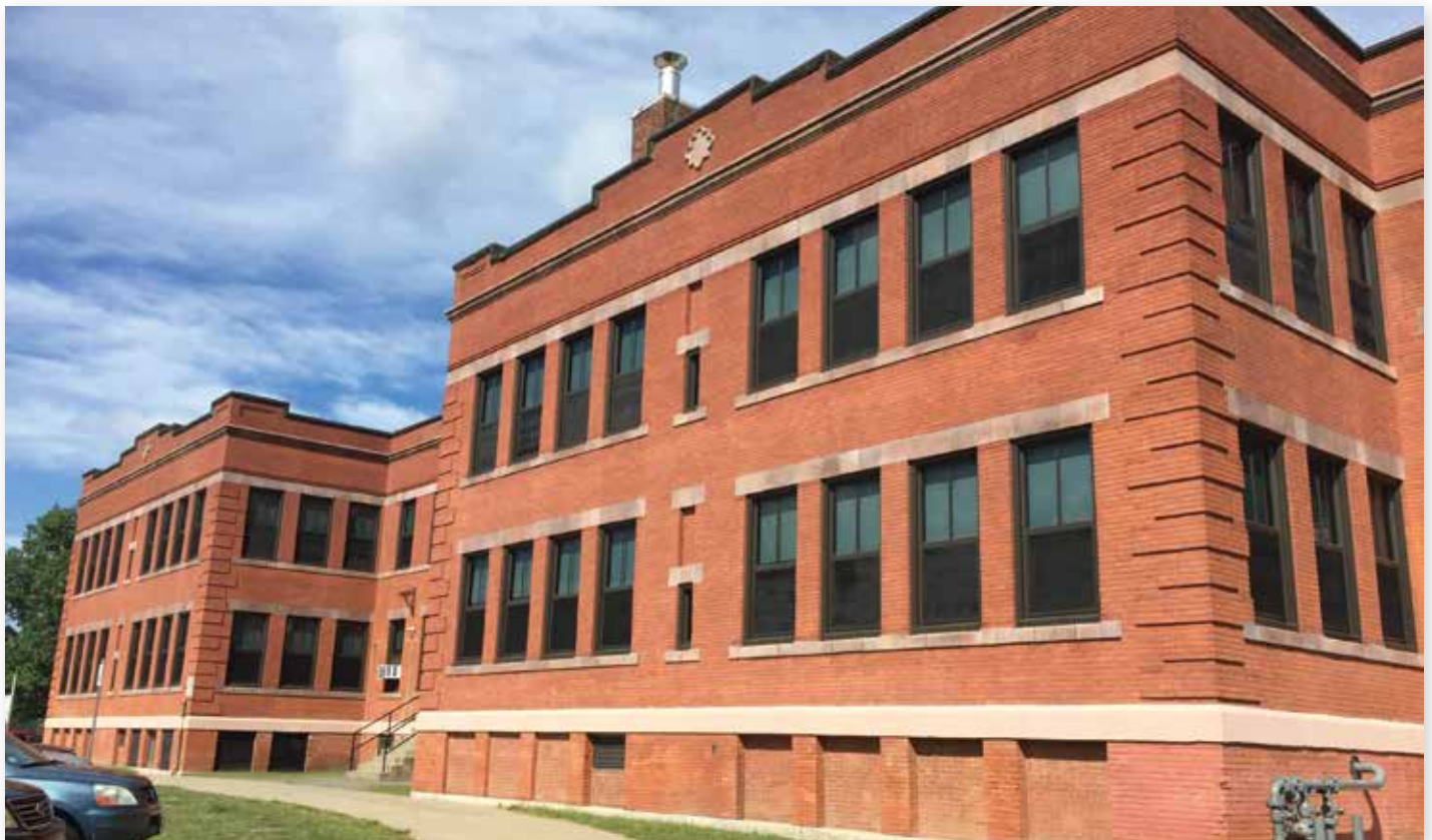
Historic replica aluminum replacement windows.