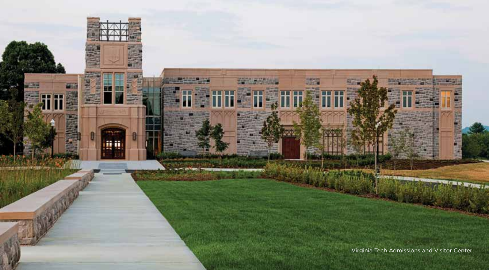
Virginia Tech Admissions and Visitor Center