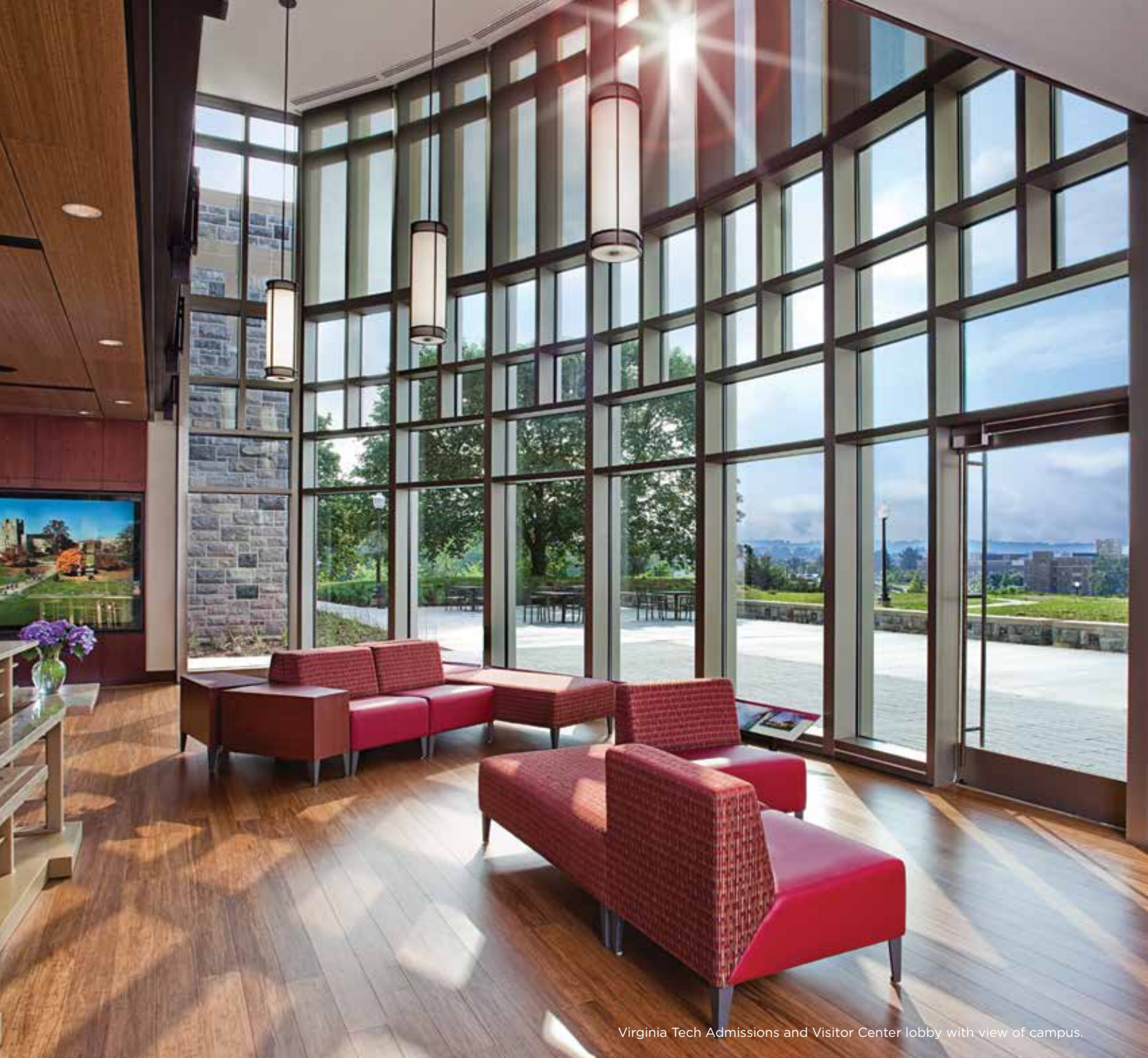
Virginia Tech Admissions and Visitor Center lobby with view of campus.