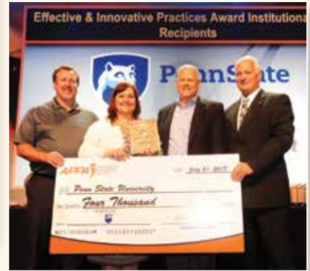
Penn State University , “Penn State’s APPA Credentialing Cohort Program”