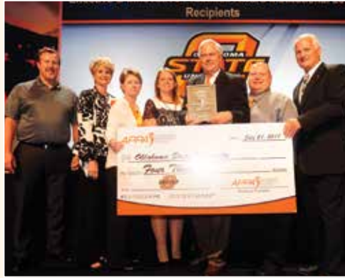
Oklahoma State University , “The Next Level Project: A Model for Effective Change”