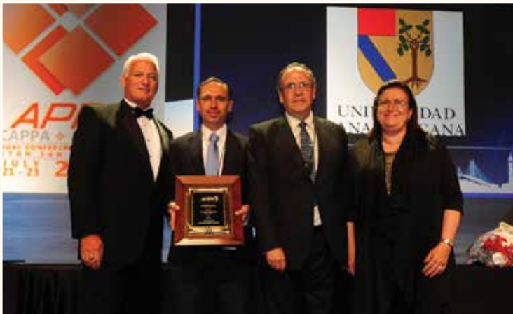
Universidad Panamericana Campus México