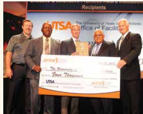
University of Texas at San Antonio , “The Development and Use of Portable Variable Frequency Drives (VFDs)”