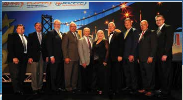
APPA's Past Presidents