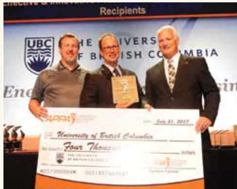
University of British Columbia , “Energy Conservation Using Campus WiFi Data”