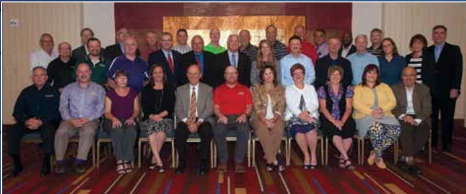
2017-2018 Board of Directors