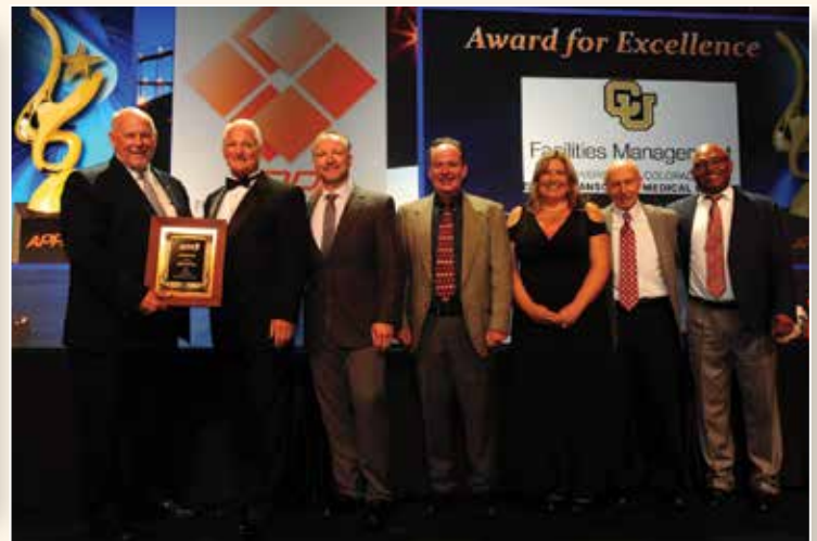
University of Colorado Anschutz Medical Campus