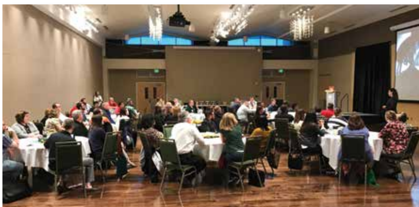
Participants intent on absorbing information.

In addition to sessions on leadership, campus safety, staff development, capital planning, smart buildings, sustainability and energy efficiencies, and more, attendees experienced a hard-hat tour of the new stadium under construction on the Colorado State University campus.