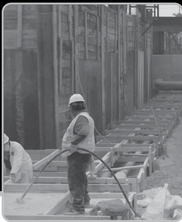
THERMAL ENERGY CORP (TECO) CHP EXPANSION PROJECT GILSULATE®500XR HAS BEEN THE SYSTEM INSULATING/PROTECTING TECO'S STEAM/COND./PUMP COND. FOR 25 YEARS! "FAILURE IS NOT AN OPTION FOR TECO."

The global economy and environmental demands have dramatically impacted the energy generation and distribution marketplace trifold. Owners are experiencing the skyrocketing maintenance and operating costs coupled with dwindling budgets; Gilsulate®500XR is the proven solution. Gilsulate®500XR offers a multitude of benefits with key points such as: long-term reliability, no maintenance system, superior BTU reductions, cost-effectiveness, flexibility, simplistic design & installation making it the overall value and choice owners are seeking today!