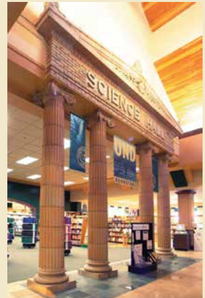
Original University of North Dakota Science Hall and the North Dakota Bookstore. The Science Hall was demolished in 1999 and the pillars were reused inside the bookstore in 2000.