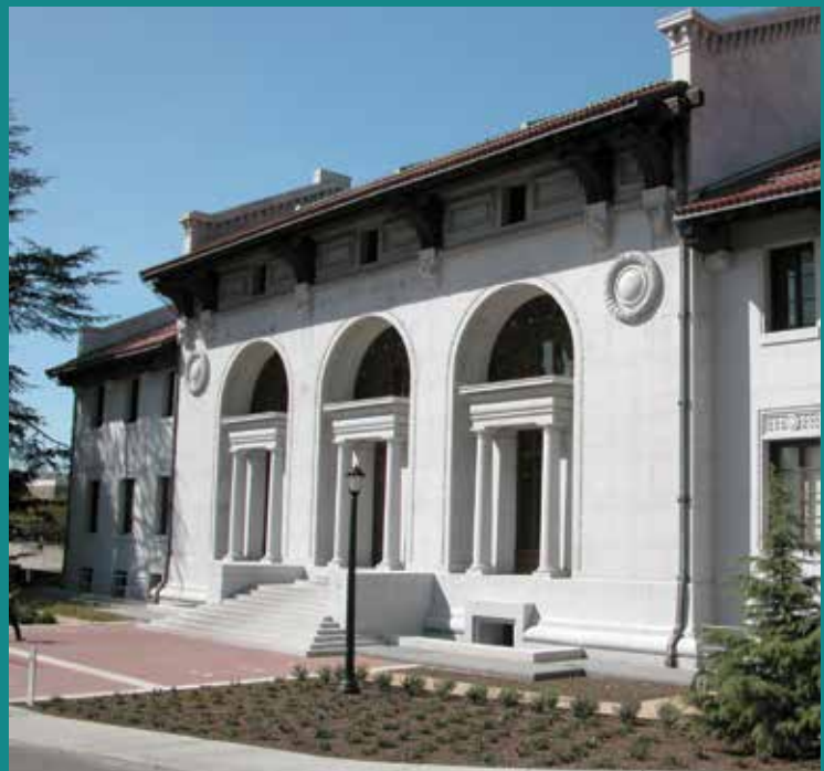
UC Berkeley’s Hearst Memorial Mining Building, after renovation.

http://www.berkeley.edu/news/media/releases/2002/09/18_hearst.html