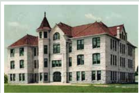
Historical Image of OSU's Furman Hall, 1902.