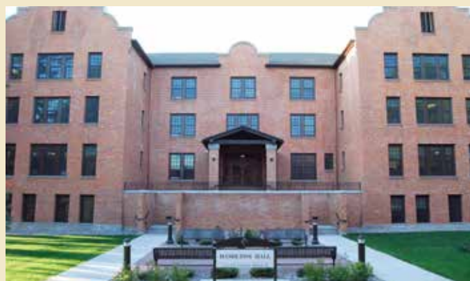
Hamilton Hall, MSU 2012, the renovated main entrance that again resembles the original main entrance, enhanced with code-required railing to the landings.