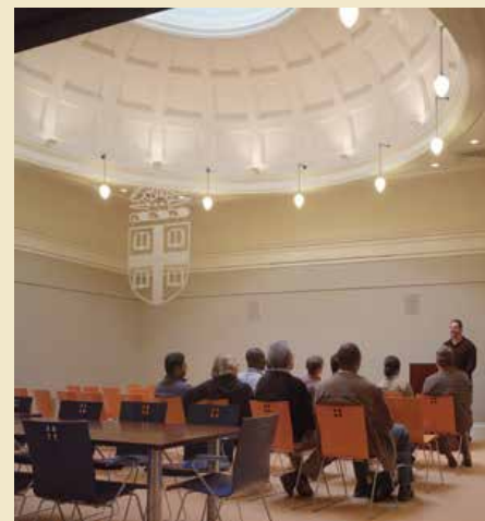
Mencoff Hall After.