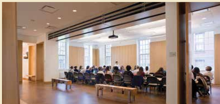
Rhode Island Hall After.