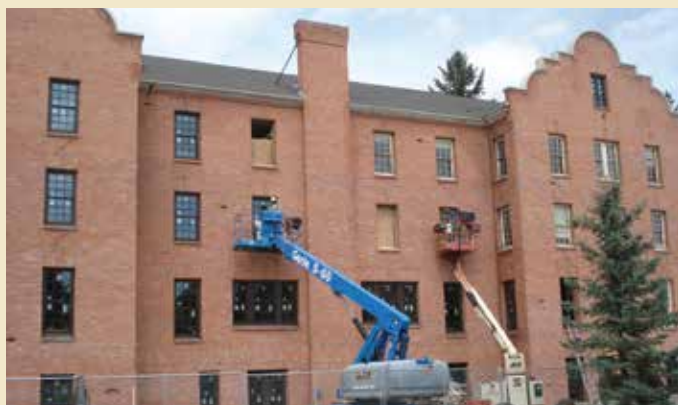
In 2009, the wood single-pane glass windows were replaced with replica double sash, multi-light dual pane windows, achieving energy improvement and historic preservation. The color of the trim was also researched and returned to its original dark color. This photo shows both the original and replacement windows.