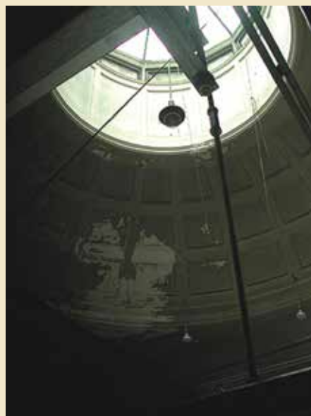
Mencoff Hall Before.