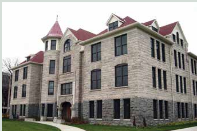
The building was renewed with a facade of limestone that recreates the original look.