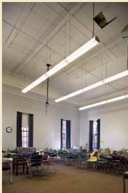
Rhode Island Hall Before.