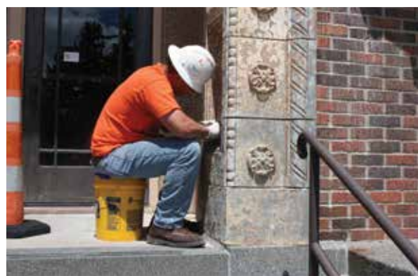
USED WITH PERMISSION FROM MSU. PHOTO COURTESY OF CTA ARCHITECTS ENGINEERS.

Lewis Hall, MSU, 2014 main entry with new green roof tiles that replaced the metal standing seam roofing installed mid-century, and the restored terra cotta medallions and decorative arch surrounding the main entry.