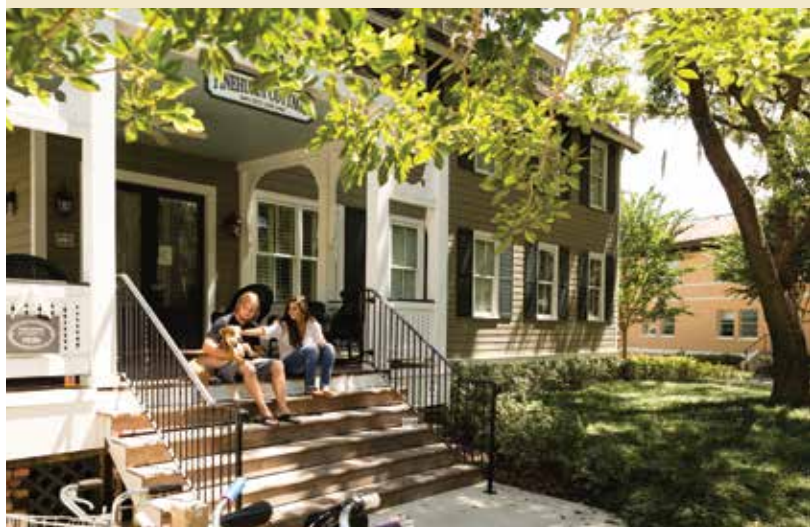
Pinehurst Cottage Today. Last of the original 1885-86 wooden buildings.