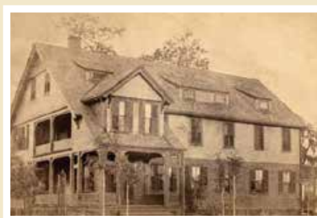
Pinehurst Cottage, early photo