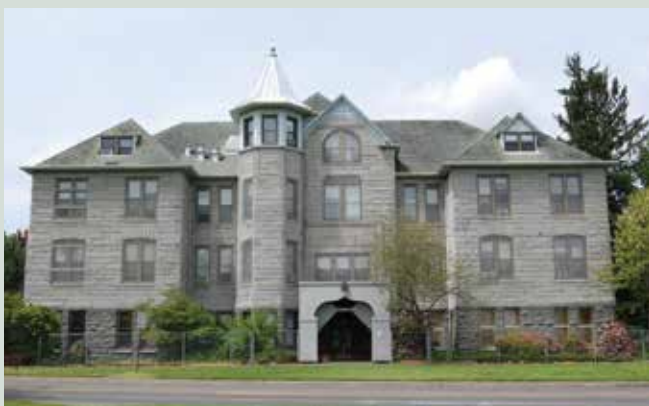
As the condition of the building deteriorated, a fence was erected to protect passersby from possibly unstable masonry.