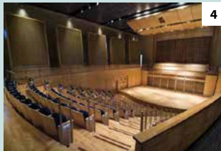
In 2007, the pool was repurposed to a Recital Hall.