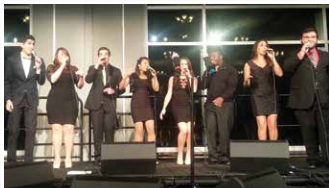
The Gold Company ensemble (Western Michigan University) performs at the President's Reception and Dinner