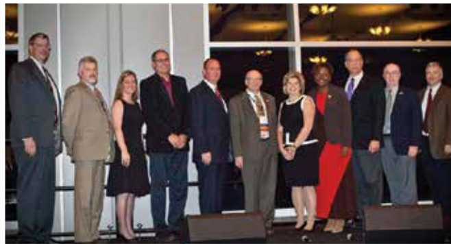
MAPPA 2013-14 Board of Directors