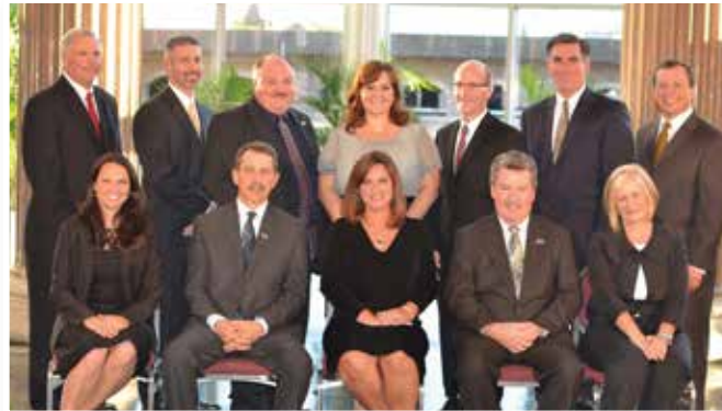
ERAPPA 2013-14 Board of Directors

At the Awards Banquet, Certificates of Appreciation were awarded to the outgo-