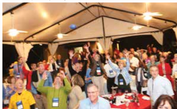
Monday night football