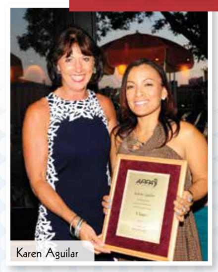
APPA Staff Award—5 Years of Service