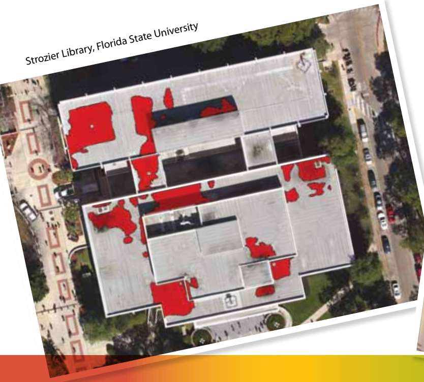
Strozier Library, Florida State University