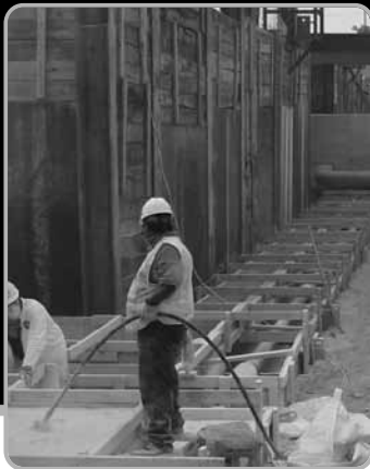
THERMAL ENERGY CORP (TECO) CHP EXPANSION PROJECT GILSULATE ® 500XR HAS BEEN THE SYSTEM INSULATING/PROTECTING TECO'S STEAM/COND./PUMP COND. FOR 25 YEARS! "FAILURE IS NOT AN OPTION FOR TECO."

UNDERGROUND CONTROLLED DENSITY INSULATING FILL and CORROSION PROTECTION SYSTEM