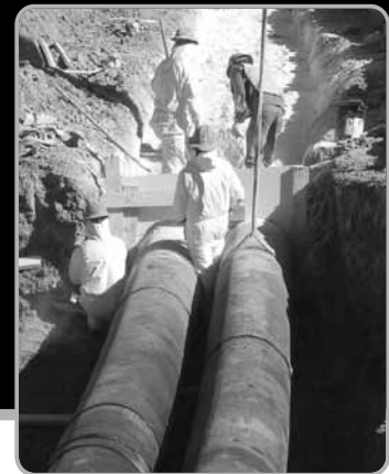
NATIONAL CENTER THERAPEUTICS MANUFACTURING - TEXAS A&M 24" HDPE CWSR INSULATED WITH GILSULATE ® 500XR. A&M'S CAMPUS DISTRIBUTION MASTER PLAN FOR CWSR/HWSR RECENTLY CHANGED FROM PIP TO GILSULATE ® 500XR.

Gilsulate International Incorporated • 800-833-3881 • 661-799-3881 • www.gilsulate.com