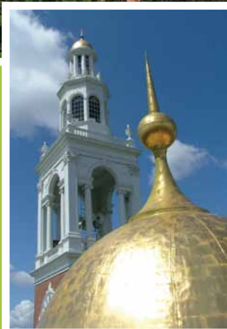
Dome and tower of Ira Allen Chapel at UVM following restoration.