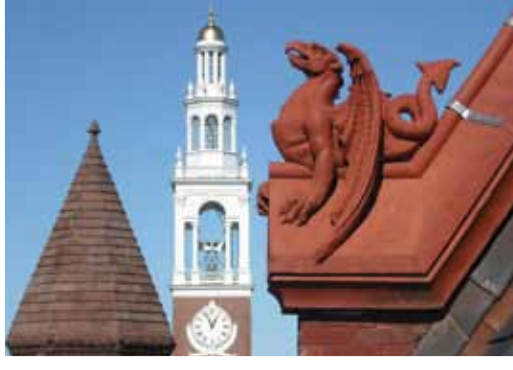
View of the historically-significant campus buildings at UVM: Williams Hall, Billings, and Ira Allen Chapel (from closest to farthest) following recent renovations by Gale Associates, Inc.