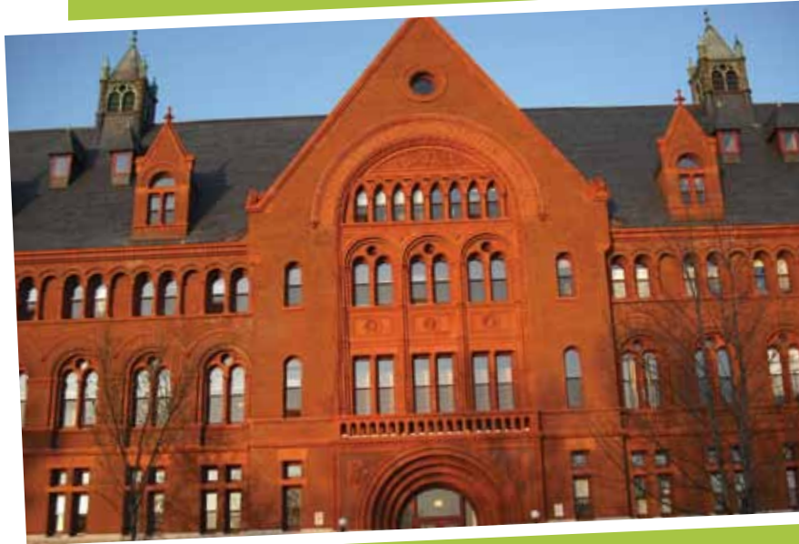
UVM's Williams Hall, circa 1896, is listed on the National Register of Historic Places following masonry, terra cotta, and window restoration to address building envelope and life safety issues.

There are reasons that our New England campuses have so many brick buildings with steep slate roofs. The brick was locally produced, its mass retained heat in winter and kept interiors