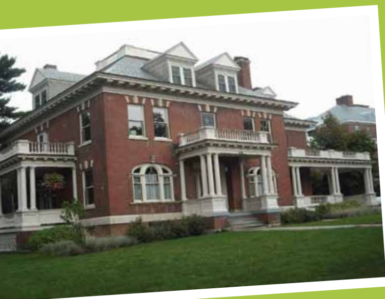
University of Vermont, 438 College Street, c. 1908 (LEED Gold)