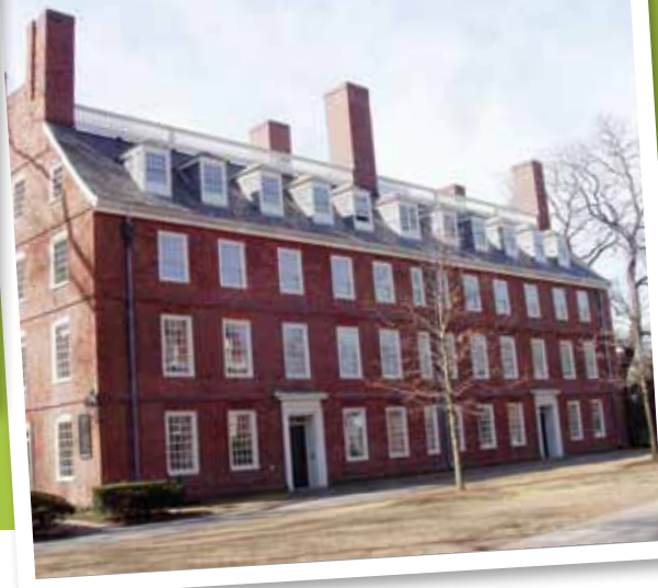
Massachusetts Hall, circa 1718, is the country's 2nd oldest continuously operating campus building. Dormitory to John Adams, John Hancock, and Sam Adams, it was designed for climate, with locally sourced brick, granite, and slate (key points – if only they had LEED certification back in 1718).

cool in summer, its thickness kept water out, and it is durable enough for the tough winters. Slate is locally retrieved, easily worked, lasts a century, and perfect to use on steep sloped roofs to shed snow. Southern campuses often have historic buildings with deep arcades and porticos to shade buildings and pedestrians, and central entrances with large halls to encourage natural ventilation (e.g., Thomas Jefferson's designs at the University of Virginia). Buildings in both climates incorporated passive solar heating and cooling concepts (before they knew to use those terms) because they were not initially serviced by fossil fuels or able to rely on them to the extent we do today.