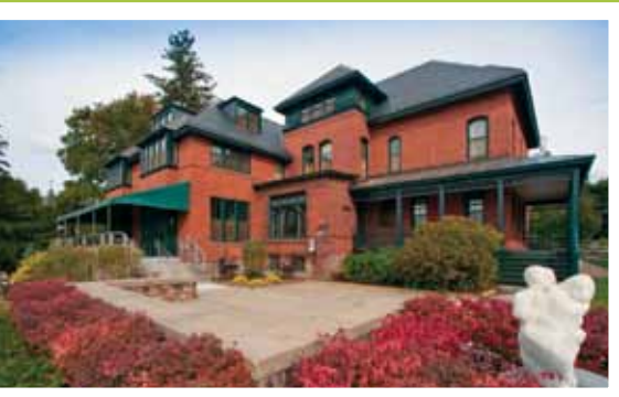
Champlain College, Aiken Hall, c. 1885 (LEED Gold)