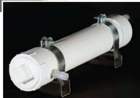
JJM Boiler Works

JJM Boiler Works introduces a complete line of condensate neutralizing tubes designed to raise the pH level of discharged condensate so it can be safely drained into sewer or septic systems. Many of today's high efficiency commercial boilers and warm air furnaces produce highly acidic condensate that is often drained from commercial, industrial, and institutional facilities into the normal sewer line or septic system. The acidic nature of this condensate can damage cast iron and ABS drain pipes, septic tanks, sump pump seals, pump levels, city sewer systems, and wastewater treatment facilities as well as local outdoor vegetation. The neutralizing tubes provide end-users with an economical, easy-to-use and environmentally-friendly alternative to this problem. For additional details visit JJM Boiler Works at www.jjmboilerworks.com