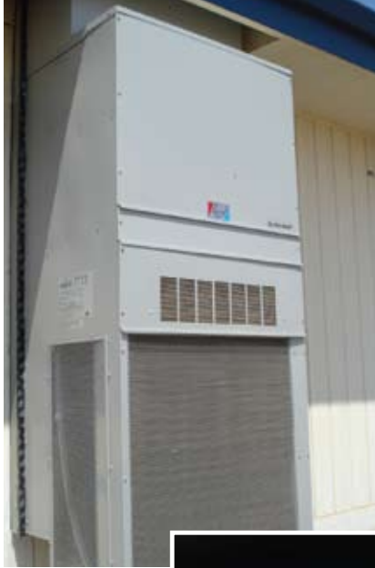
Quiet Climate 2

mounted. Designed specifically to provide quiet operation in classrooms, the Quiet Climate 2 heat pump is the most innovative wall-mount ever made. The HVAC unit provides operating sound levels 20 to 35 times quieter than standard units. The Quiet Climate 2 is 44 percent more energy efficient, has more effective ventilation, uses "green" refrigerants and is designed for fast installation and easy servicing. It not only works well with new construction but is also easily retrofitted to older classrooms, including portable classrooms. For more information about Geary Pacific visit www.gearypacific.com