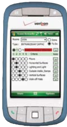
PocketPC™ Cleanliness Level Inspection Software

INFORMED LLC introduces General Property PocketPC™ Cleanliness Level Inspection Software. Compatible with the latest mobile operating systems, the software provides a fast and accurate method of assessing a facility's cleanliness level and works seamlessly with INFORMED's flagship ManageWize Cleaning Management Software™. Cleanliness level philosophy stipulates that cleaning organizations are successful if they achieve the cleanliness level for which they