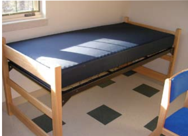
University Sleep Products, Inc.'s Enhanced Style B™ mattresses

University Sleep Products, Inc.'s Enhanced Style B™ mattresses are made with SoFlux OX ticking and were designed without a taped edge. Removal of the taped edge seam eliminates the weakest part of a mattress where it can unravel from use or abuse. Once this seam unravels the whole mattress will come apart, turning it into landfill fodder. Removing the taped edge also eradicates the nesting site where bed bugs can nest and lay eggs within a mattress. Additionally, replacing the taped edge with inverted lock stitched side seams prevents fluids from seeping in through the taped edge seams.