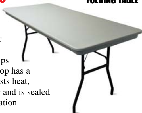
THE HEAVY DUTY PLASTIC FOLDING TABLE