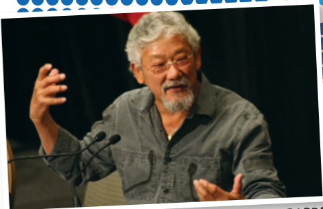
Keynote speaker Dr. David Suzuki addresses ERAPPA members at their Capital Ideas for Sustainable Resource Management conference.