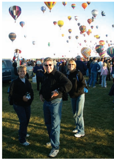
PCAPPA attendees enjoy the International Balloon Fiesta.