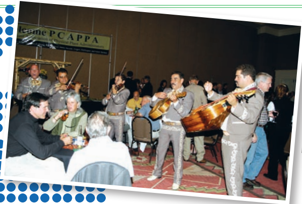
RMA mingled at the Welcome Reception with the background sounds of a Mariachi band.

For those wishing to experience our southwestern culture, a day trip to Santa Fe or shopping in Old Town Albuquerque was just the ticket. In addition, conference attendees could choose an afternoon of New Mexico wine tasting at the beautiful