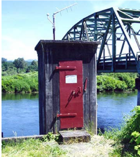
The USGS began locating telemetry sites like these upstream to improve their forecasting of flooding in select areas.

It began to dawn on owners of these expensive resources that processor time was the most precious commodity in the equation. Economics are never very far away. Colleges and universities found that additional “dumb terminals” could be added to the computers, allowing the user to initiate programs, call data sets, and watch the results, but programs still had to be written and edited from a workstation hooked directly into the computer. Professors (being professors) found a way to get terminals to work from their offices or labs.