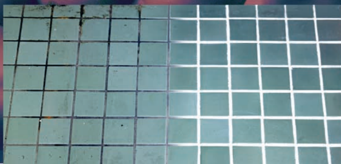
Before the SaniGLAZE process