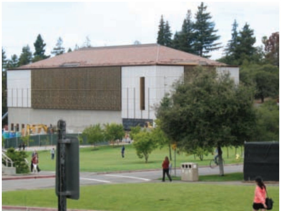
Large bronze screens, cast in China, adorn three sides of the East Asian Library.