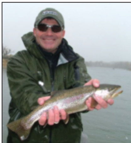
Early morning fly fishing excursion on Big Horn River nets a big catch.

The conference was preceded by an offering of "The Supervisor's Toolkit." The first official conference activity was an early Friday morning 10-boat fly fishing trip down the renowned Big Horn River. Then a group of golfers set out to conquer the Eagle Ridge course with the first three holes being played in the snow. Later in the day, a bus full of adventurers traveled to Pompey's Pillar, a major landmark from Lewis and Clark's epic "Corps of Discovery" journey, followed by a tour of the historic Little Big Horn battlefield. That evening our fabulous