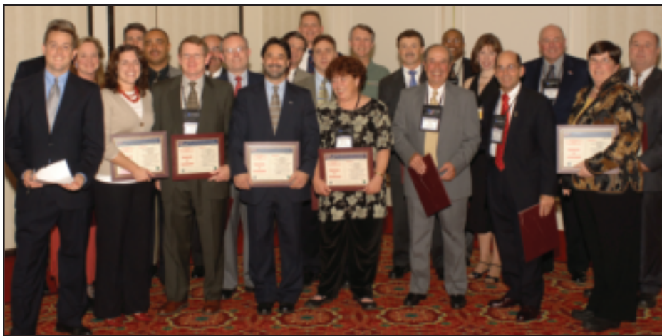
The 2006 Host Committee breathes a sigh of a relief at the Tuesday night banquet.