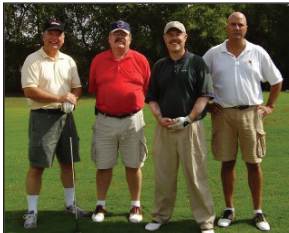
Members take a break from playing golf at the Pecan Valley Golf Club.

Mission Trails, the Alamo and time to play golf at the Pecan Valley Golf Club. There was also a tour of Trinity's