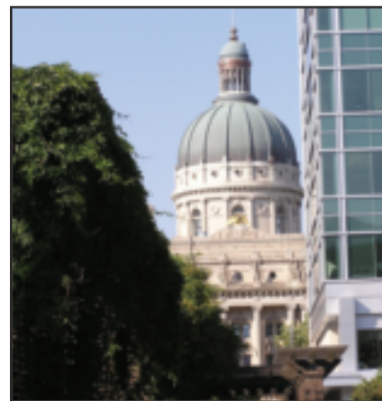
The conference took place in the heart of downtown Indianapolis, across the street from the Indiana State Capitol building.

The official kickoff for the conference was the opening reception held at the NCAA Hall of Champions. Surrounded by exhibits extolling the