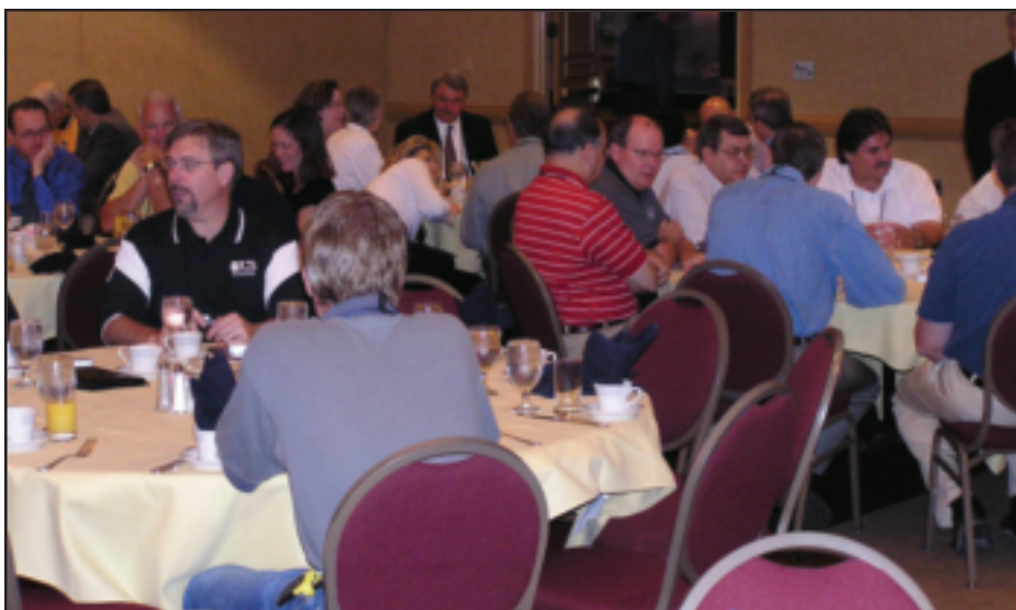
MAPPA members listen to updates and relevant committee information at the business meeting.

live by the African word “moomba” which means, “let’s get together and have fun.”