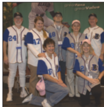
The Duke University Team worked hard to organize a fabulous conference.

A Barney Fife impersonator was the featured guest at Sunday's luncheon. He doled out citations for a number of frivolous transgressions and showed everyone how nice and shiny he kept his one bullet.