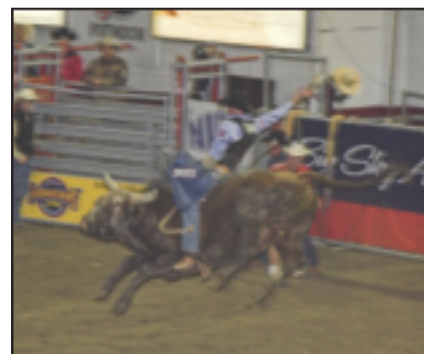
Contestant rides a fierce bull at the National Finals Rodeo.