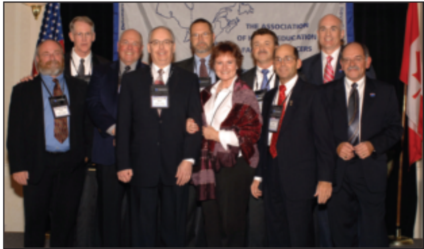
Ten of the last 13 ERAPPA presidents were on hand in Mystic, CT.

Since ERAPPA has used the Internet, there has been a significant increase of communicating on the Web. The decision to post annual meeting information via the Internet