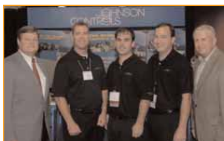
Johnson Controls, Inc.