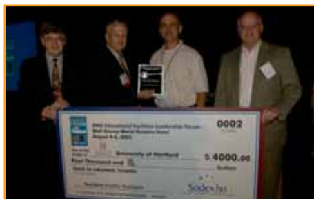
University of Hartford—"Resident Facility Assistant"