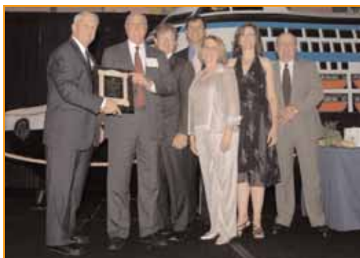
University of Florida

APPA's highest institutional honor is the Award for Excellence in Facilities Management. This award recognizes those educational institutions whose facilities management organizations have demonstrated excellence in overall operations and effectiveness. The 2005 AFE award winner is the University of Florida.