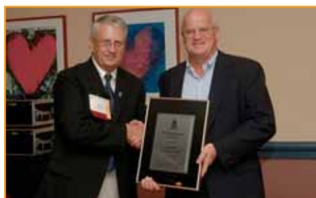
Sodexho Campus Services