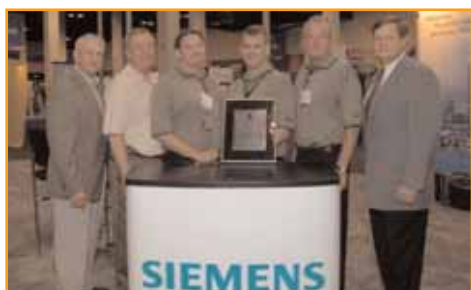
Siemens Building Technologies