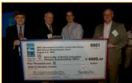
University of British Columbia—"UBC Campus Sustainability Office, Sustainability Coordinator Program"