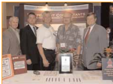
Lerch Bates and Associates— Elevator Consulting Group