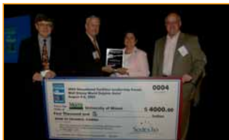
University of Miami—"How the University of Miami's Facilities Administration Department Uses Customized Financial Reports to Manage Costs"