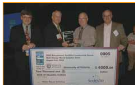
University of Victoria— "Water Reuse Initiative"