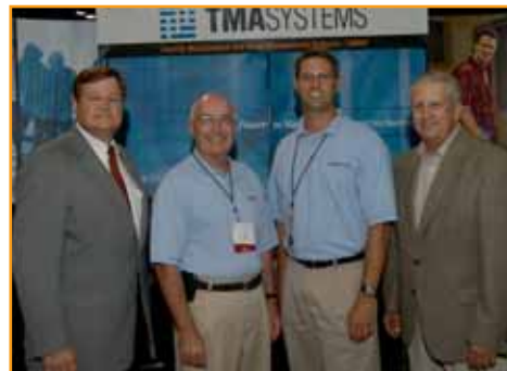
TMA System, LLC

Absent: ARAMARK Facilities Services, GLHN Architects & Engineers, Inc., and GBBN Architects.