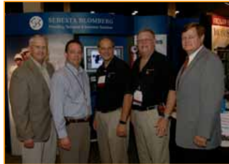
Sebesta Blomberg & Associates