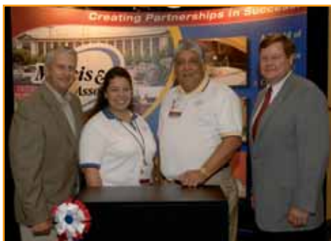
Marcis & Associates