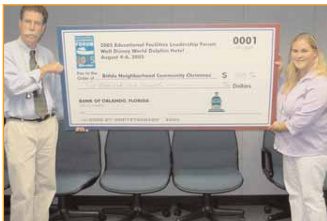
A check for $3,750 is presented to the Bithlo Christmas Neighborhood Center for Families.