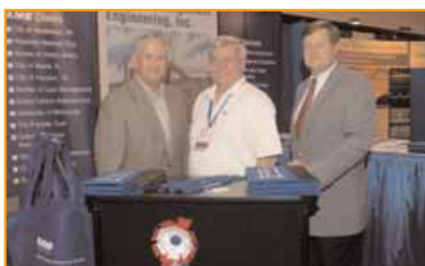
Applied Management Engineering, Inc.