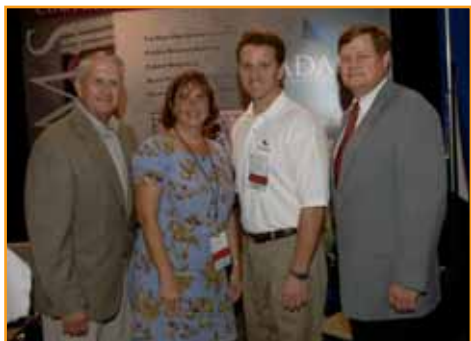
Adams Consulting Group