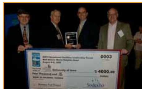
University of Iowa—"Biomass Fuel Project"