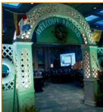
A nautical theme greeted the banquet guests.