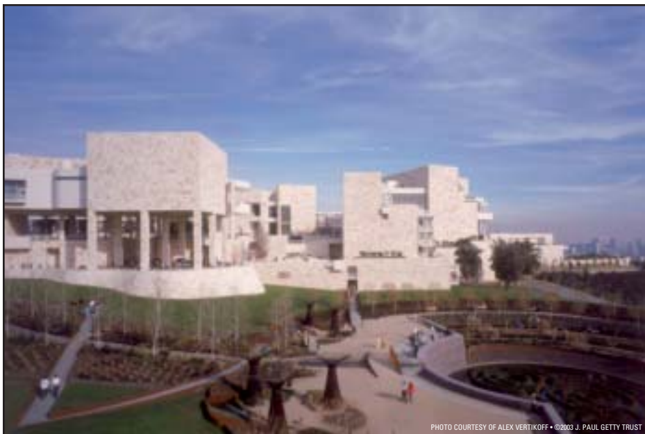
J. Paul Getty Museum and Central Garden