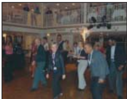
SRAPPA members rocking the boat on the Monongahela River.