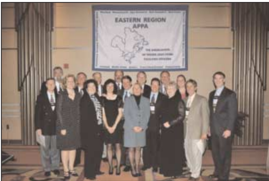
2003 ERAPPA Host Committee