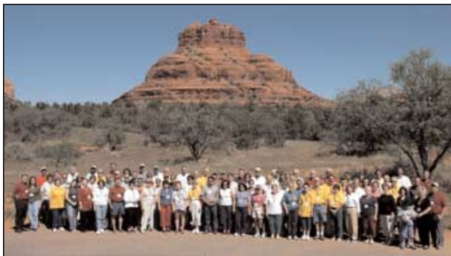
RMA attendees pose in front of Bell Rock.