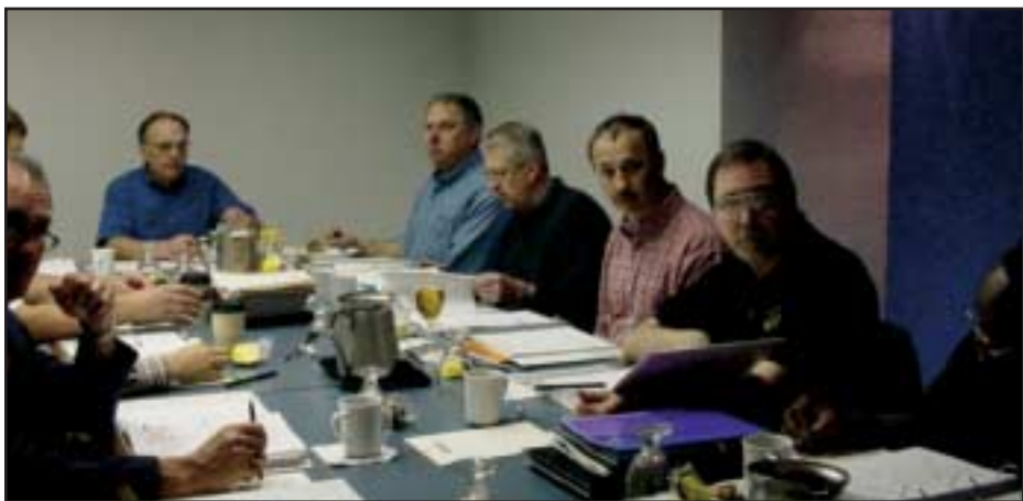
CAPPA Executive Committee discusses upcoming issues

that support with results in a graduated level of membership. Each level of Business Partner membership would provide an increased recognition within the CAPPA organization. The benefits of the program have received broad support of the Business Partners.