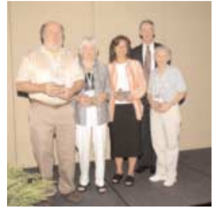
Supervisor's Toolkit Task Force