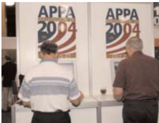
APPA's popular cyber cafe allowed members to keep in touch with home.