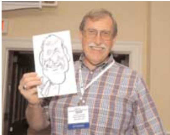
Hey, does this really look like me?