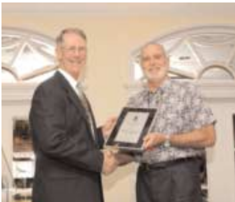
Lerch, Bates and Associates Inc. Elevator Consulting Group