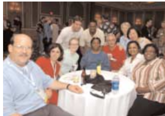
and an eager staff