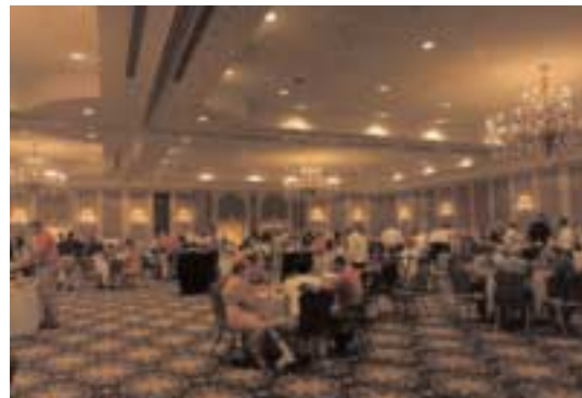
Everyone had a grand time.