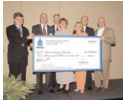
University of Florida for "T.O.P.G.U.N. Journey to Customer Service Excellence"