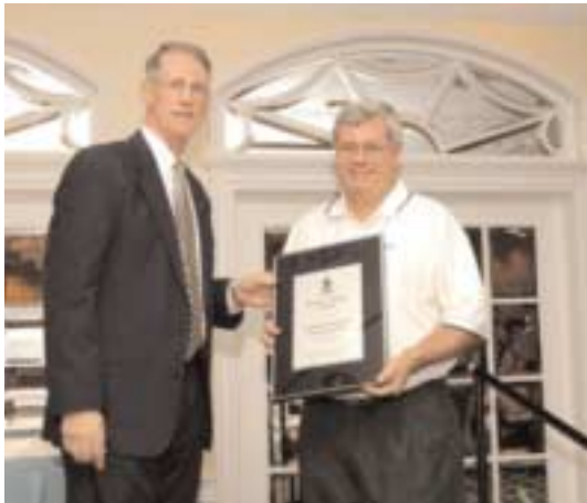
Applied Management Engineering, Inc.