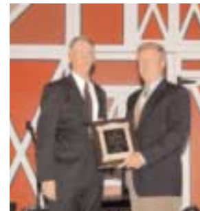
University of Maryland/Baltimore