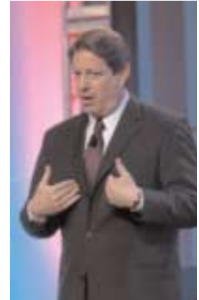
The Honorable Al Gore