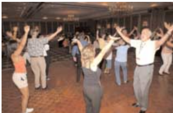
with entertainment provided.