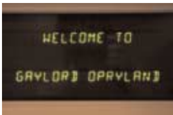
And prepare to be lost.

We take a look back at the Forum through the eyes of our photographer. We congratulate our membership, business partners, speakers, spouses, and guests for a job well done and hope that everyone learned a few things and had a great time.