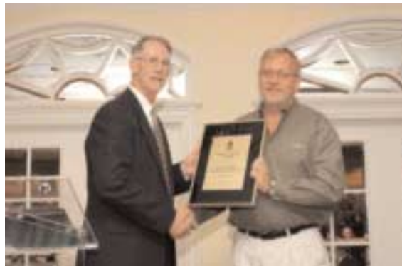
Siemens Building Technology, Inc.