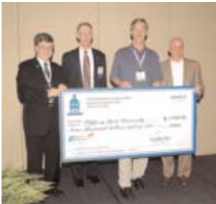
Slippery Rock University for "Stockless Custodial Supply Chain"