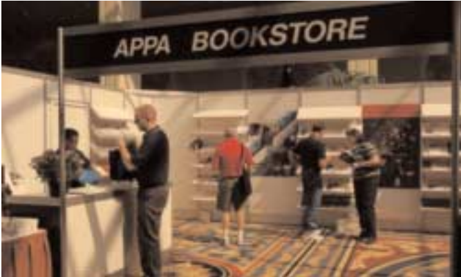
Cotrenia Aytch of APPA assists in publication sales.

Where were you when you weren't in sessions?