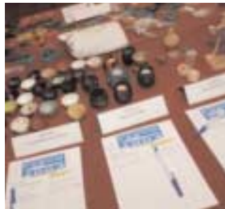
Just a few of the 200 items that were available at the silent auction.

The mission of this year's charity, Edgehill Center, is to empower families and individuals by providing quality childcare, youth enrichment programs, parent education, and community services for low- and middle-income residents of the South Nashville area.