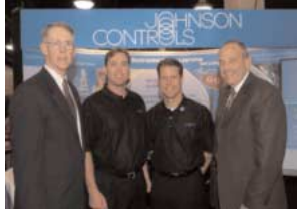
Johnson Controls, Inc.