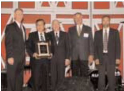
Iowa State University of Science and Technology

APPA's highest institutional honor is the Award for Excellence in Facilities Management. This award recognizes those educational institutions whose facilities management organizations have demonstrated excellence in overall operations and effectiveness.