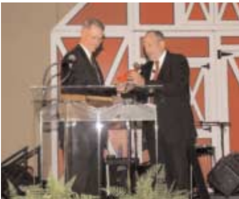
The gavel is passed.