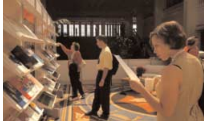
Members check out APPA's new releases.