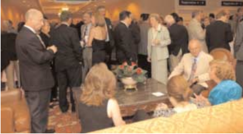
Attendees enjoy their last chance to network at the banquet reception.

Our week together begins to wind down . . . .