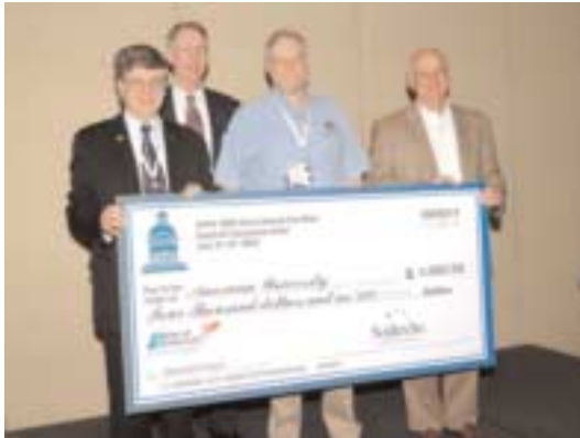
American University for "Safety Alert Program"

This year's Effective & Innovative Practices Awards recognized programs and processes that enhanced service delivery, lower costs, increase productivity, improve customer service, generate revenue, or otherwise benefit the educational institution. This award is sponsored by Sodexo USA and was presented to the following universities.