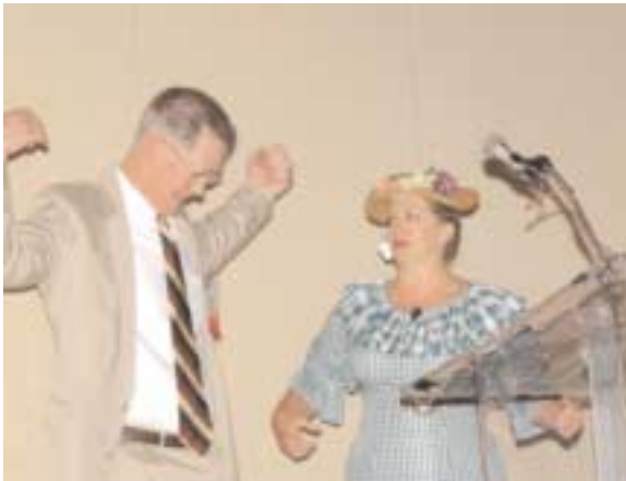
Breakfast of champions with "Minnie Pearl."