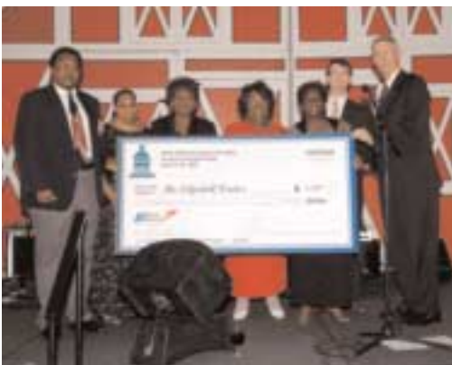
Edgehill receives a check from APPA.