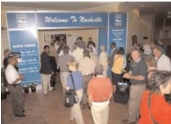
Everyone is eager to visit the exhibits.