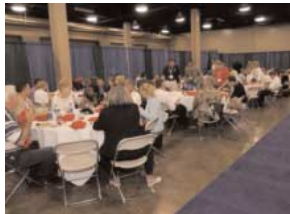
One of the bigger draws of the exhibit hall were the fabulous lunches.