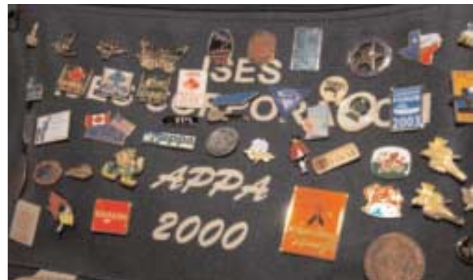
And as usual, pin trading made a strong showing.