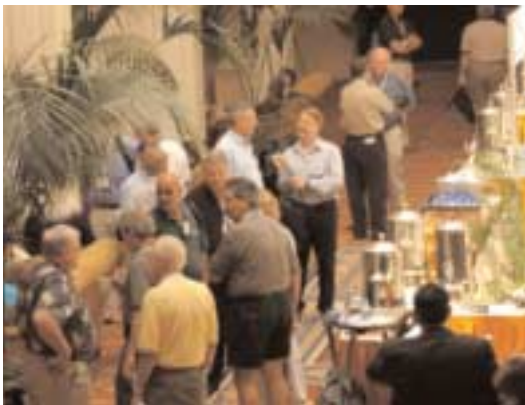
Break time . . .