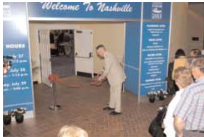
Opening the exhibit hall.