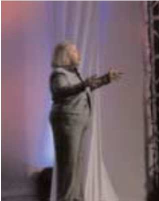
Rosabeth Moss Kanter

Our General Session speakers inspired our attendees while sessions offering one of our three perspectives (customer service, information technology management, and environmental stewardship) provided them with valuable information.