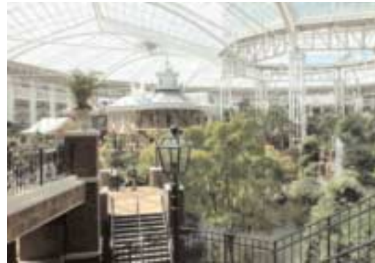
But experience a unique environment