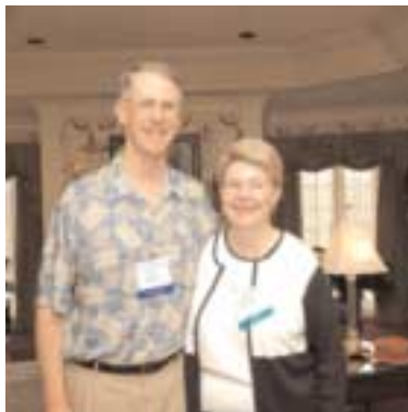
with friendly hosts