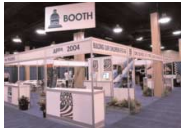
APPA's booth—the quiet before the storm.