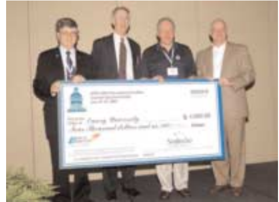
Emory University for "Using Emory University's Building Acceptance–Occupancy Approval Checklist to Improve Turnover of Buildings from Construction to Maintenance and Operations at Occupancy"