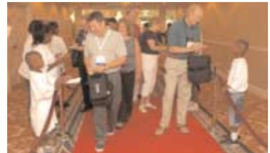
Edgehill children welcomed hungry attendees as they made their way to the Welcome breakfast.