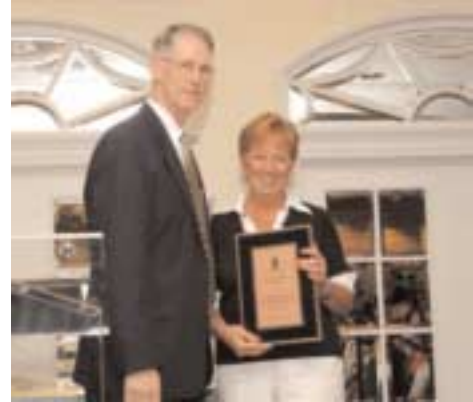
Gage-Babcock & Associates