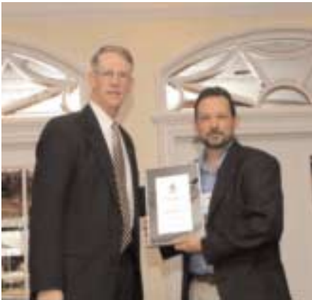
Sebesta Blomberg & Associates