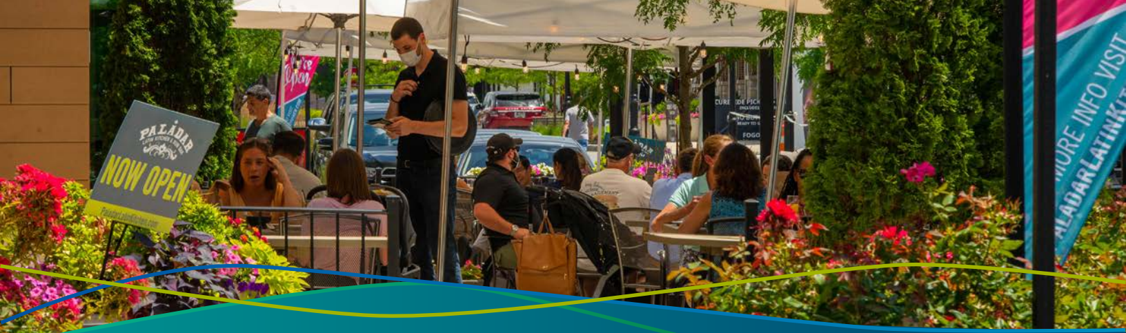
EXHIBIT ONLY SPONSOR

Forty (40) Opportunities $3,500 Member / $5,025 Non Member