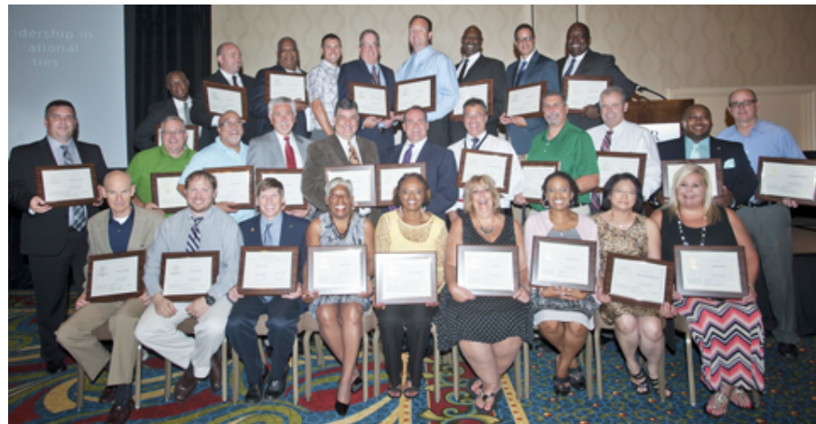
Institute for Facilities Management graduates.