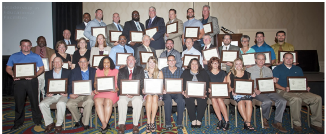
Leadership Academy graduates.

Congratulations to APPA's Institute and Academy Graduates from September APPA U!