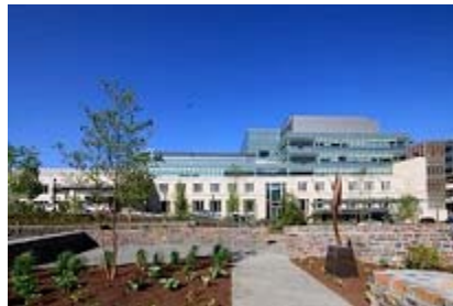
Highlights of the Cancer Center's LEED certification include lots of natural lighting and open, green spaces.

The Duke University Cancer Center and Chilled Water Plant #2 have been awarded LEED Gold certification. Along with bike racks and showers for bicycle commuters, the Cancer Center also features a rooftop garden, large windows to allow for natural lighting, and occupancy sensors. The chiller plant is able to capture water condensate on the roof and store it for for the building's cooling towers. Learn more.