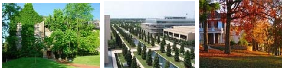
(From left: University of Guelph, University of Texas at Dallas, Western Kentucky University)

CSUSM, located close to Camp Pendleton and several other military installations, has the highest percentage of student veterans per capita of any California State University campus. Learn more about this exciting new facility.