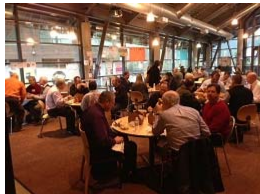
Educational facilities professionals attending the December 12 APPA Drive-In Workshop at the University of Washington.