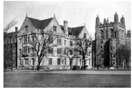
The first annual conference of the newly formed Association of Superintendents of Buildings and

Grounds of the Central Western Colleges and Universities met in Chicago in spring 1914. Attendees stayed at the Sherman House, left, and met on the campus of the University of Chicago, where construction of a new classics building, right, was underway.